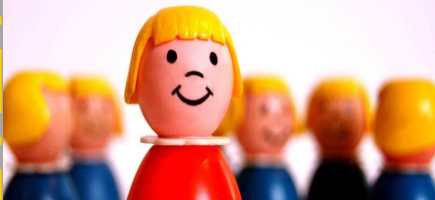
"FUN" drawings contributing to our total funds raised to date 24/25