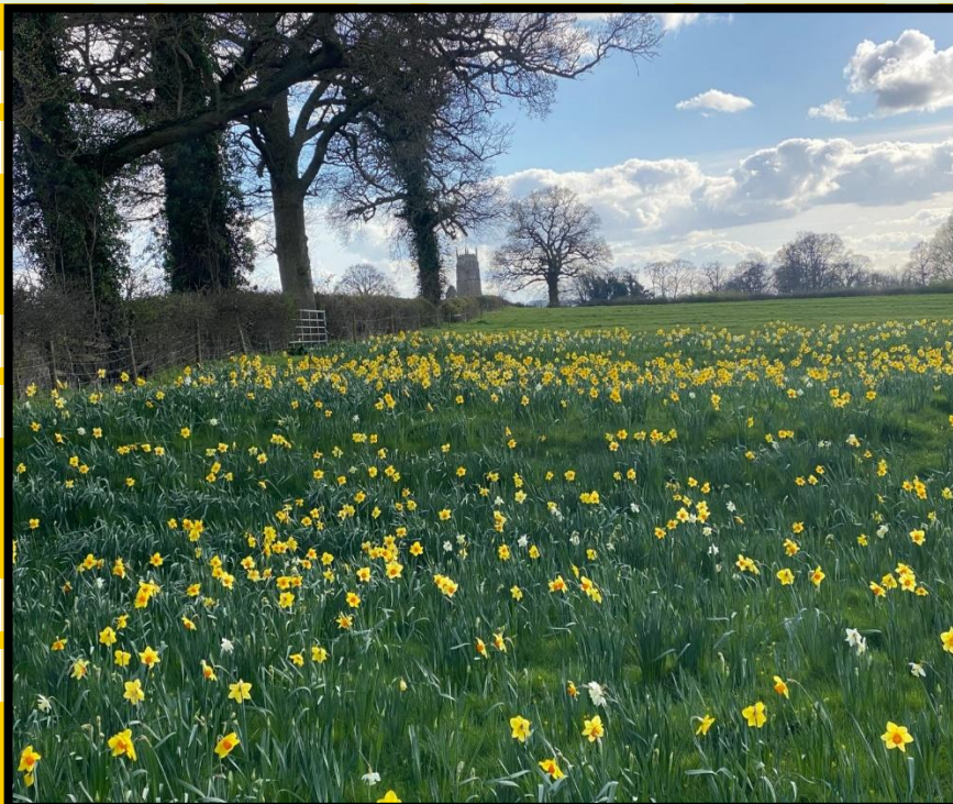
Above; PYO Daffodils at Glebe Farm, Brailes. Below: Our current Fundraising Efforts