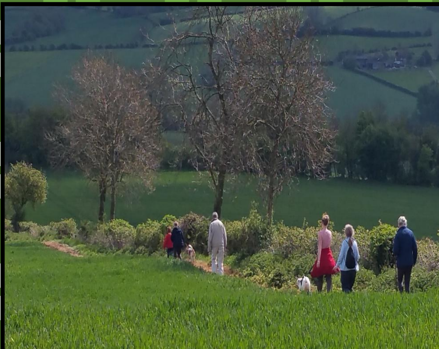
Above; Brailes 3 Hills Walk, taking place this year on May 5th Below: Our current Fundraising