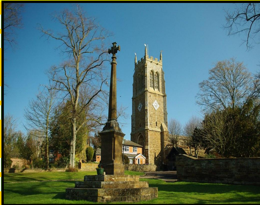
Above; St George Church, Brailes Below: Our current Fundraising Efforts

"FUN"draising contributing to our total funds raised to date 24/25