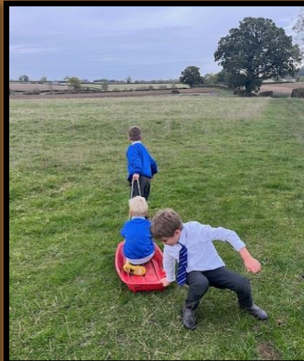
(Above right) After school fun, grass sledging at our FOBS open meeting at Glebe Farm 18/10! (after a hot chocolate and cake treat!)